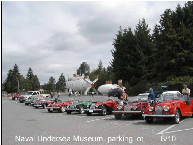
Naval Undersea Museum parking lot 8/10