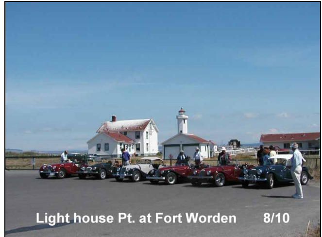
Light house Pt. at Fort Worden 8/10