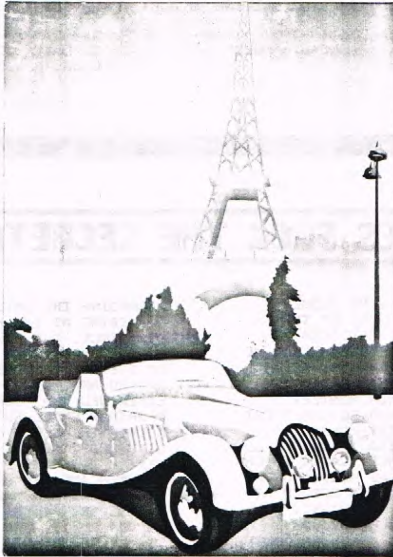
POST CARD, ZENITH PUBLICATIONS DISCOVERED BY DAUGHT AND MEREDITH SMITH I