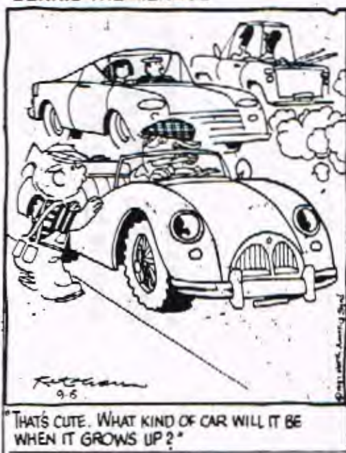
DENNIS THE MENACE