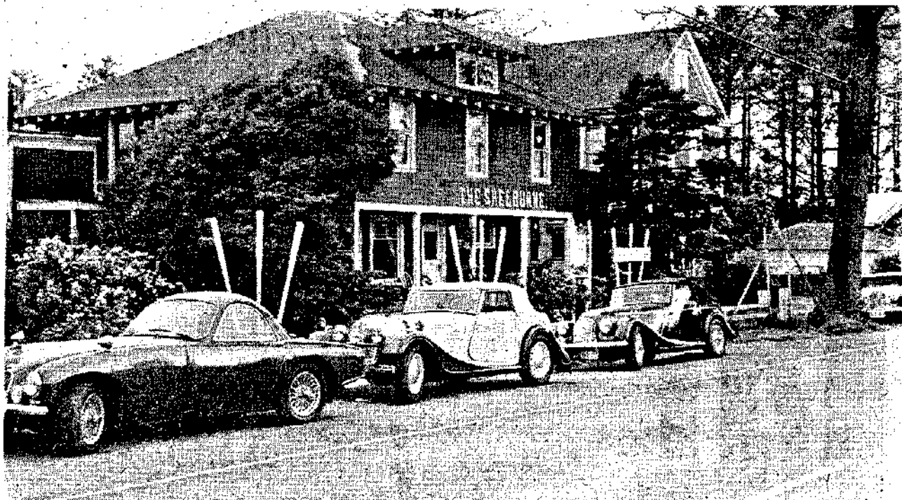
MORGANS VISIT THE PENINSULA — Members of the Oregon and Washington Morgan Car Owners' Group visited the peninsula last weekend. About 10 members of the club stayed at the Shelburne Inn in Seaview, providing a picturesque background. The handmade Morgan sportscar, constructed only in England, is famous for its oak wood frame and expensive price. Members of the club are about 40 to 45 strong in the two states.